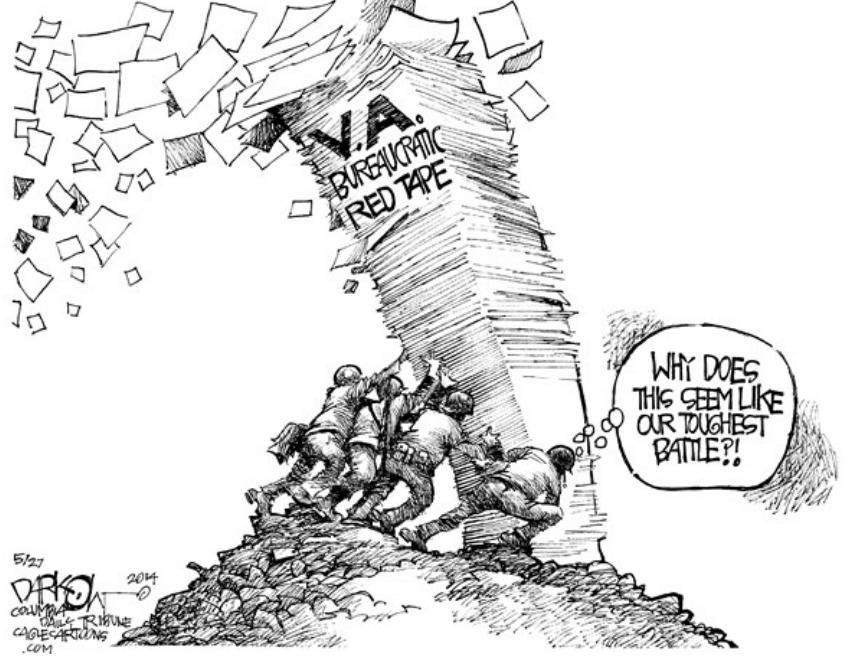
Fig. 1. This political cartoon repurposes the ideology of the famous Iwo Jima photograph to comment on the V.A. healthcare debate.